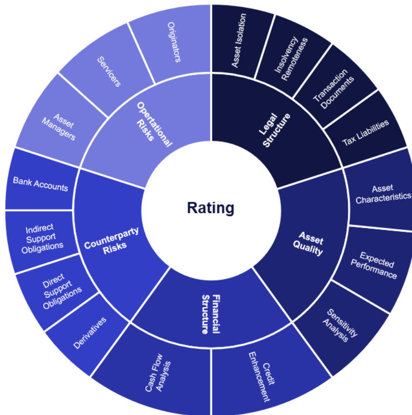
Exhibit 1 Rating Components

Exhibit 1 shows the key analytical components and sub-factors PENGYUAN considers when assigning and monitoring credit ratings for structured finance transactions.